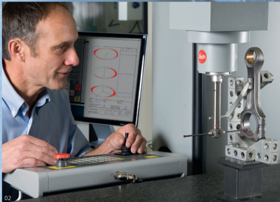
01 - Conrod for Mercedes-Benz OM 447 02 - Measurement of a conrod for Mercedes-Benz OM 611 03 - Cylinder head for Mercedes-Benz OM 906