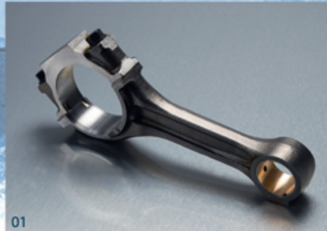
04 - Camshaft for MAND 0836 05 - Oil cooler for MAND 25/28 Series 06 - Crankcase for Mercedes-Benz OM 442 07 - Crankshaft for MAND 0826

Our products permit you to perform very high-quality and low-budget major overhauls and repairs on current and proven engine series from the manufacturers Mercedes-Benz, MTU, MAN, Volvo, Scania, Deutz, DAF, RVI . We attach great importance to availability of our goods.